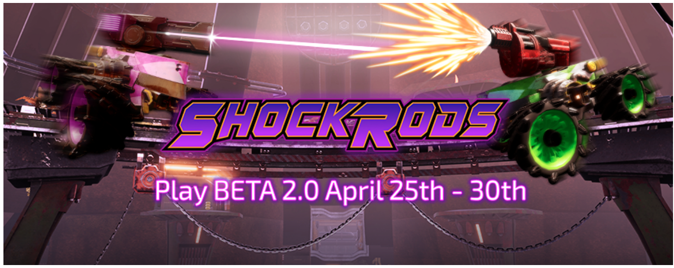
UI & Audio. Sign ups for BETA 2.0 are live!: